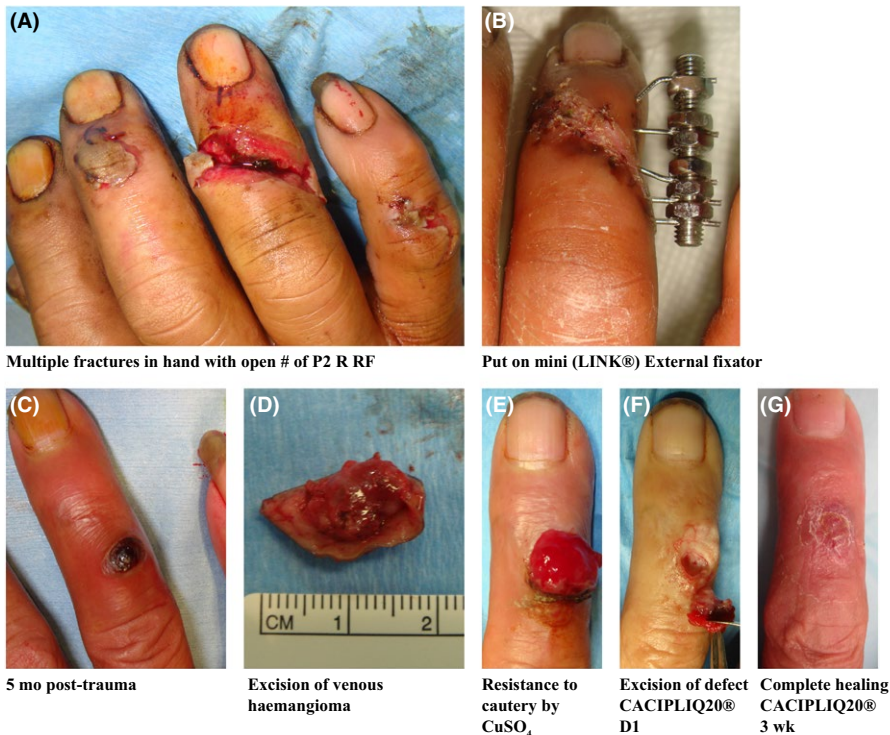
FIGURE 2 Chemical cauterization of granulation tissue. A, An outstation lorry business owner sustained an open fracture of his R RF as part of multiple injuries to his right hand after it was hit by a steel tire rim. B, A mini external fixator was applied, and it went on to heal. C, 5 mo post-trauma, he developed a venous hemangioma. D, This was excised with clear margins. E, Excessive granulation tissue occupied the defect and was resistant to cauterization by copper sulfate ( \text{CuSO}_4 ). F, Excision was done, and the 4 mm deep defect treated with CACIPLIQ20 ® . G, Complete healing in 3 wk

(metacarpophalangeal MP joint), which is unusual in burn contracture cases (Figure 1F).