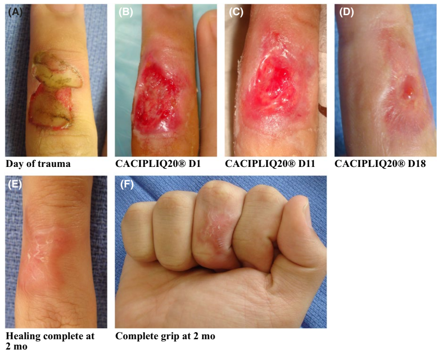
FIGURE 4 Electrical burn. A, Patient 4 was electrocuted instantly on the radial three digits of his right hand, with third-degree burns to the dorsum of his MF measuring 20 mm × 10 mm. B, CACIPLIQ20 ® was started 24 d after the trauma occurred. C, Healing was observed within a week as seen by the formulation of granulation tissue and by Day 11 the wound was half its size. D, Wound closed by D18. E and F, Healing was complete and full range of motion with strong grip was achieved by 2 mo of application

(Figure 3B), which would have taken at least 4 weeks to heal. 15 It was decided to start CACIPLIQ20 ® the next day because his pain tolerance was low (VAS—visual analog score—of 7) and conventional treatments had failed. One week after application, improvement (Figure 3C) and pain relief were already felt by the patient. Within 2 weeks of commencing CACIPLIQ20 ® , the patient's VAS score dropped from 7 to 4 and the wound size had reduced to 5 mm by 5 mm (Figure 3D). All of his wounds dried up by day 17 of application.